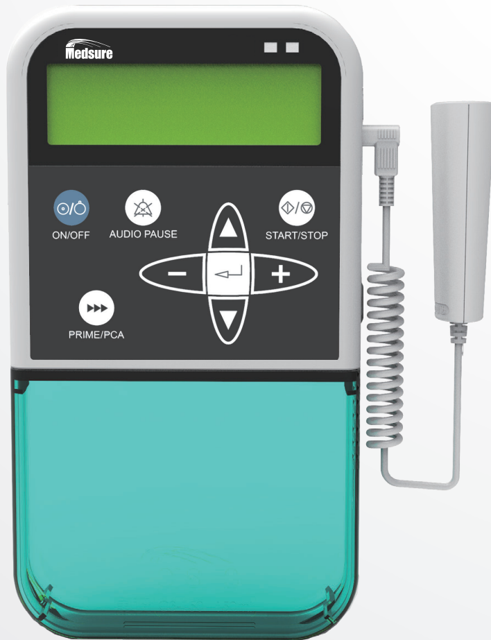
Additional PCA Bolus